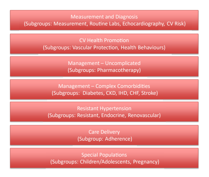
Figure 1. Hypertension Canada Guidelines Committee section structure. CHF, congestive heart failure; CKD, chronic kidney disease; CV, cardiovascular: IHD. ischemic heart disease.

Rabi et al. 2020 Hypertension Canada Guidelines